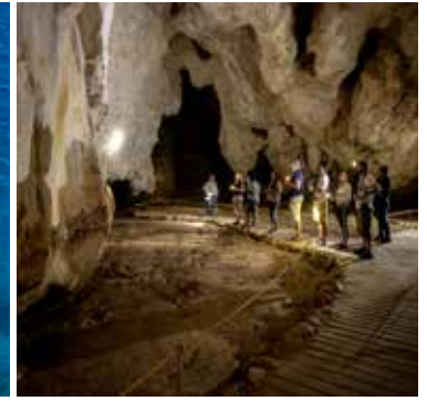
2 DAY REEF & OUTBACK