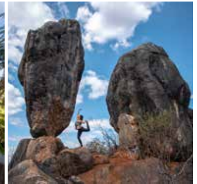
2 DAY DAINTREE & OUTBACK